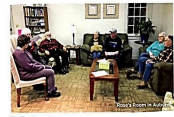
Auburn's Rose's Room

For more information please call (207) 998-2547